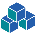
Early Head Start

Pregnant women and families voluntarily participate in visits that promote parents' ability to support a child's growth and development. In 2020, six EBHV models were operating in Pennsylvania using public (state and/or federal) and private funds to support their programs. Each model has distinct characteristics and meets families' unique needs in different ways: